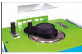
Large diameter rebars bending kit (optional).