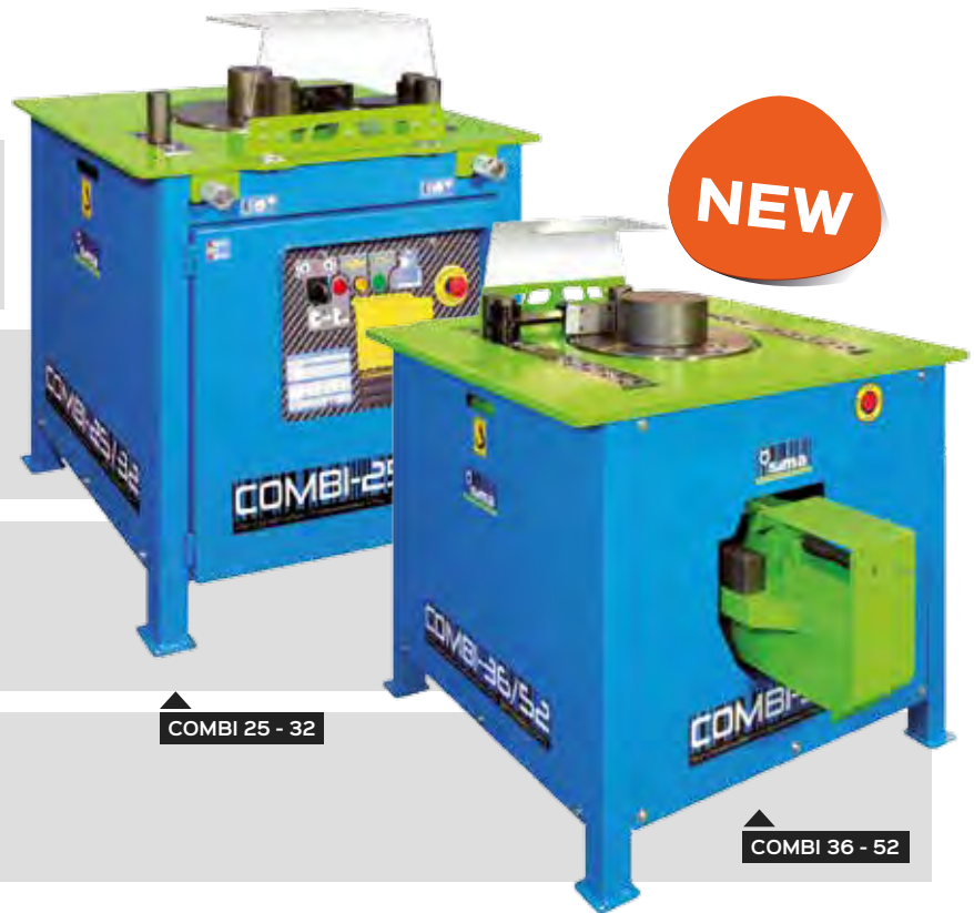
COMBI 25 - 32

4 | Production of spirals, rings and arches using the optional Spirals Bending accessory