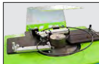
Spirals / hoops bending accessory (optional).