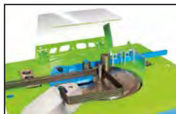
Stirrup device for max. rebar Ø 14mm / 5/8" - #5 (optional).