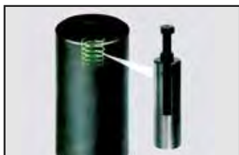
Pins with new anti stick lubrication system. Bolt for extracting pins (optional).