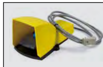
Safety foot pedal control.