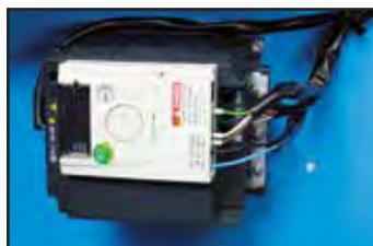
Inverter equipped (Single-phase). Reduced noise operation.