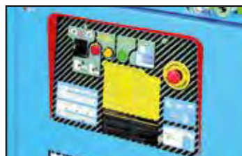
Protection shield for control panel.