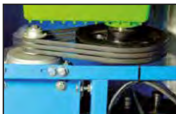
New easy and quick belts tightening system.