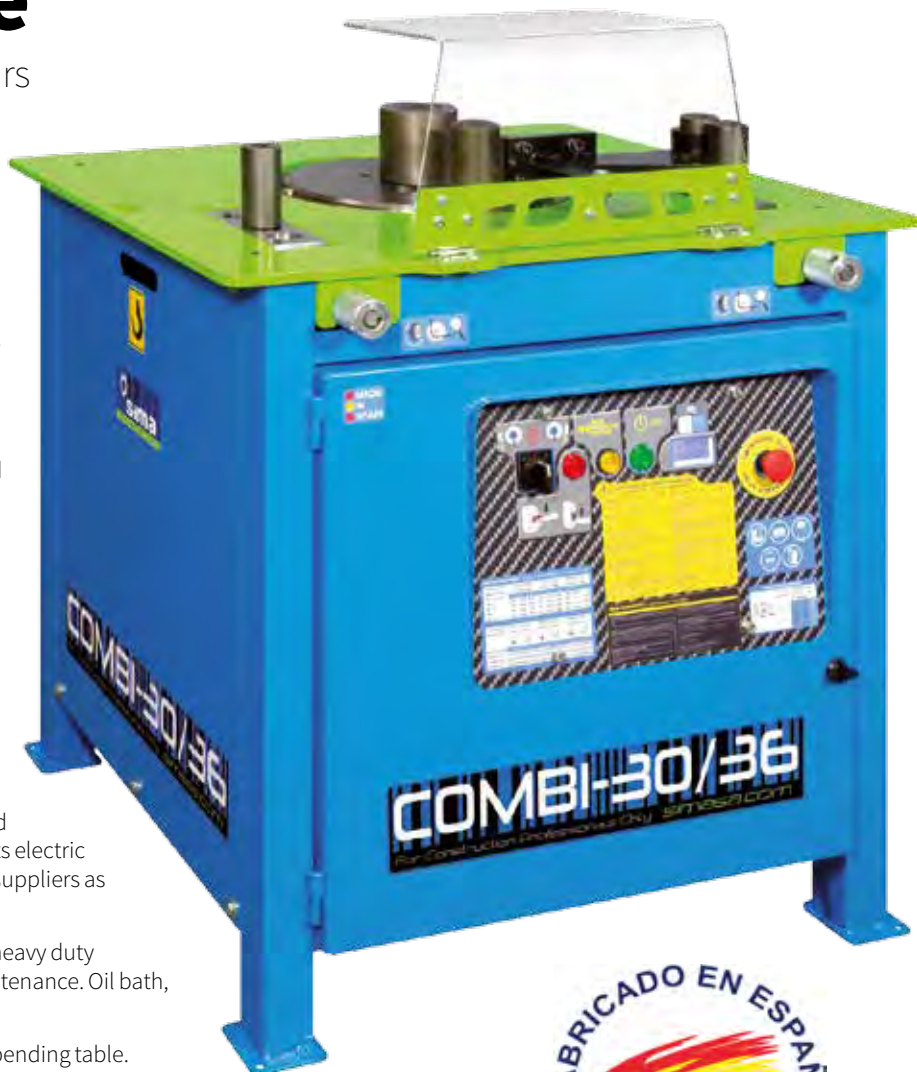
COMBI 30 - 36