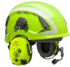
MT15H7P3EWS6 / MT15H7P3EWS6-111