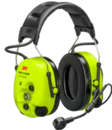
MT15H7AWS6 / MT15H7AWS6-111